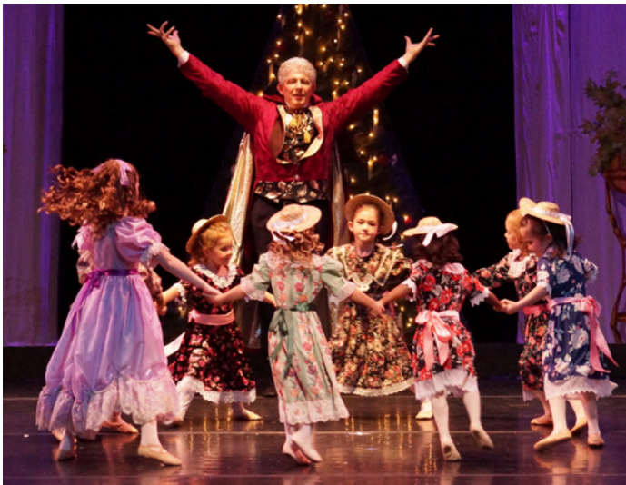
Pre-Ballet dancers join Clara and Drosselmeyer in The Nutcracker , performed November 2021.